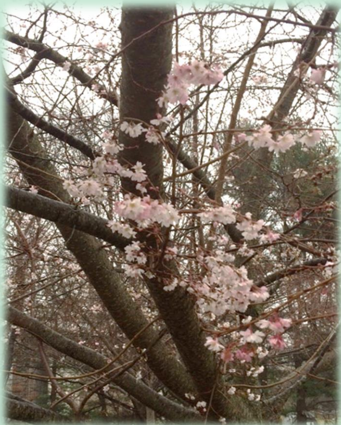
Flowering trees on December 23, 2015, the 2 nd day of Winter!! near the playground.